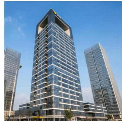
Figure 4: Zhaorun Bld.

And this is just a start, because the aim after 3 years is to expand into a true Innovation Village which would be a refurbished Mao-period electricity plant (still with the big chimneys, yes!); to become the largest startup and innovation ecosystem under one roof in the world.