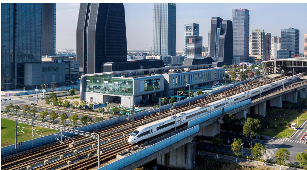
Figure 3: High Speed Railway New Town, Suzhou North Station

This industrial cluster has been leading the next-generation electronics and IT, advanced equipment manufacturing (industry 4.0), many top level German and French manufacturing giants have setup here 5 to 10 years ago.